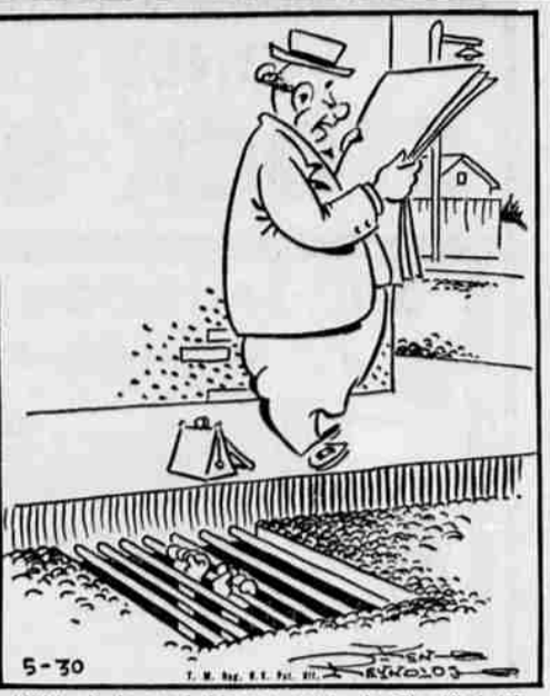
With all the good things to eat in the Classified Ads—your diet is killing me!

Notice regarding subscription changes and contact information for the newspaper.