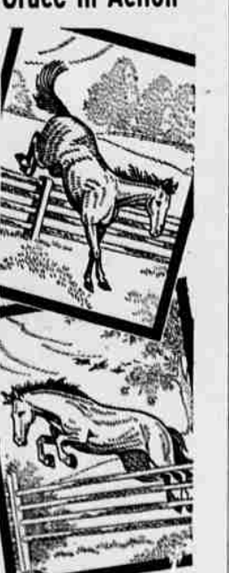
7075 by Alice Brooks

Add color, drama to hall, mantle or room with thoroughbred in natural tones. Capture a moment of excitement of a steeplechase in embroidery. The family will love this pair. Pattern 7075; transfers 9 1/2 x 12 inch; color chart. THIRTY-FIVE CENTS (coins) for this pattern—add 15 cents for each pattern for first-class mailing and special handling. Send to Alice Brooks, Medford Mail Tribune, Needlecraft Dept., P. O. Box 163, Old Chelsea Station, New York 11, N.Y. Print plainly NAME, ADDRESS, PATTERN NUMBER. 1963's Biggest Needlecraft Show stars smocked accessories—it's our new Needlecraft Catalog! Plus over 200 fresh-to-you designs to knit, crochet, sew, weave, embroider, quilt. Plus free pattern. Send 25c now!