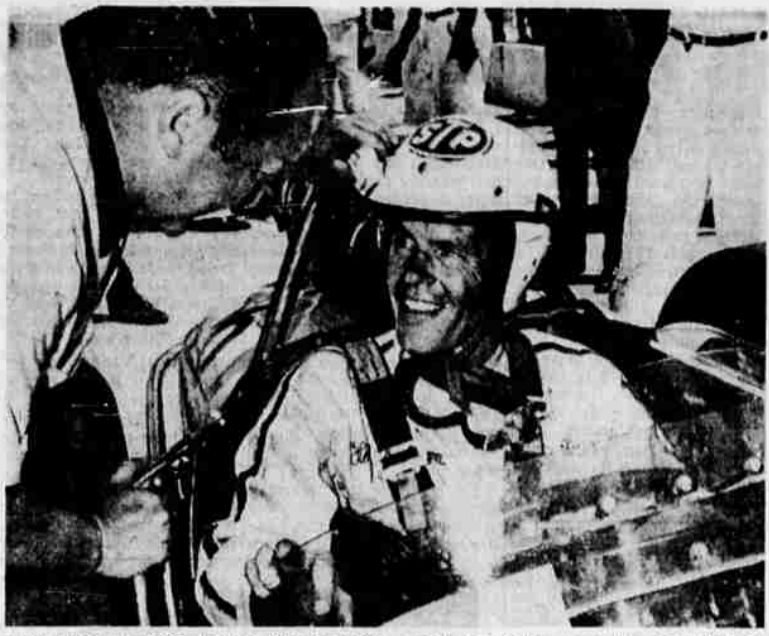
UNSER QUALIFIES —Rookie driver Bobby Unser, right, and owner Anthony Granatelli smile after Unser made a qualifying lap speed in his eight-cylinder Novi, Unser joined Art Malone and Jim Hurtubise as drivers of the first three Novi specials to join the 500 field at Indianapolis.