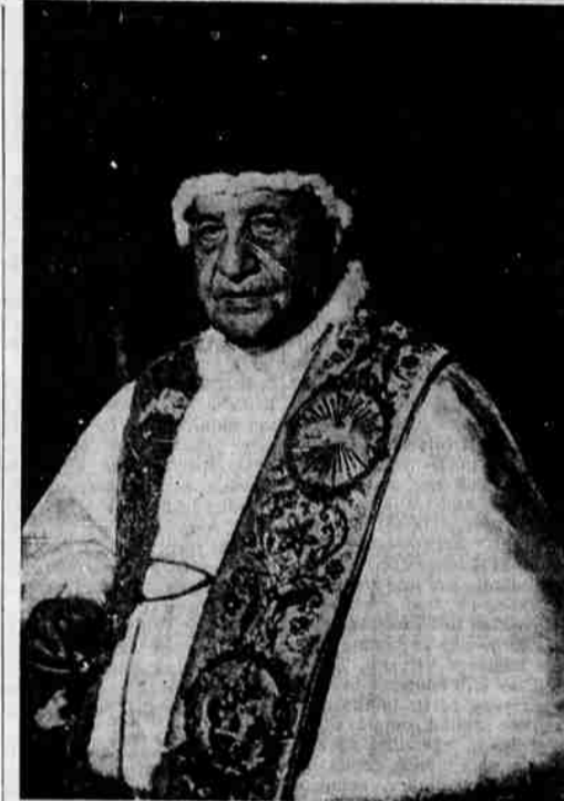
SLOWLY RECOVERING - Pope John XXIII, slowly recovering from a recurrence of a chronic stomach ailment, remained under doctors' care in his private apartments Saturday with strict orders to "take it easy." The 81-year-old pontiff, who had over-tired himself by recent public appearances, began to suffer internal bleeding earlier last week. The Pope is shown here in a news photo released by the Vatican last Wednesday.

The building had been entered from the southwest door, officers said.