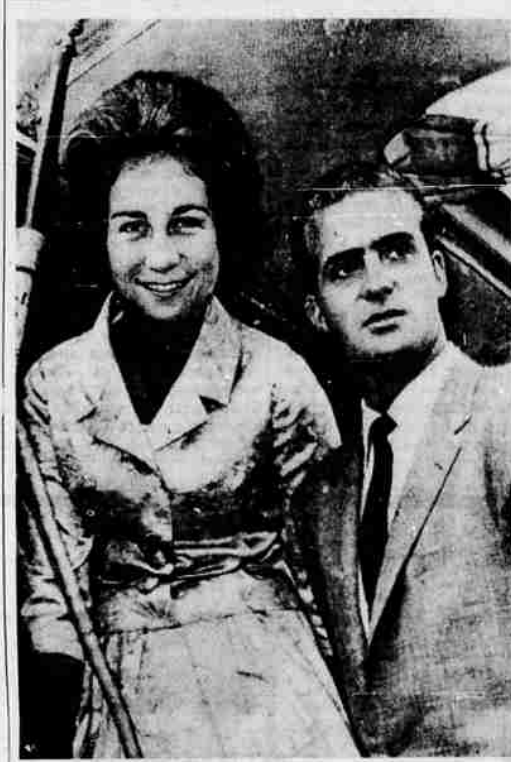
EXPECTING BABY — Princess Sophie, wife of the Prince who some day may become the Prince of Spain, is expecting a baby in December. Princess Sophie and her husband, Don Juan Carlos, are shown in Madrid.