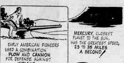
EARLY AMERICAN PIONEERS USED A COMBINATION PLOW AND CANNON FOR DEFENSE AGAINST INDIANS...