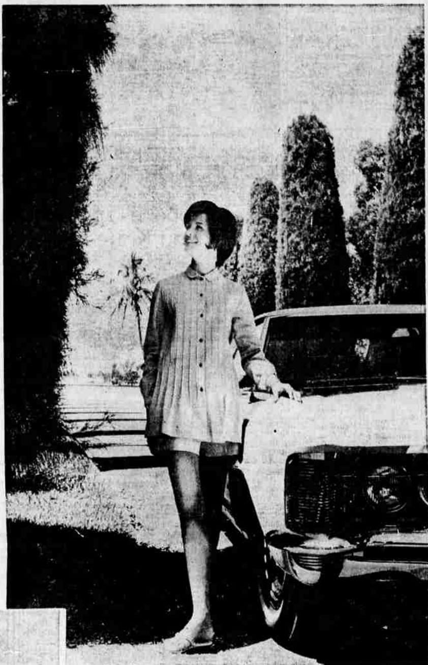
An acapulco shirt in unbleached muslin, subtly tucked for shape and stitched in red, will add both chic and comfort to a girl's summer. Designed by Anne Fogarty, it reflects the Mexican influence.