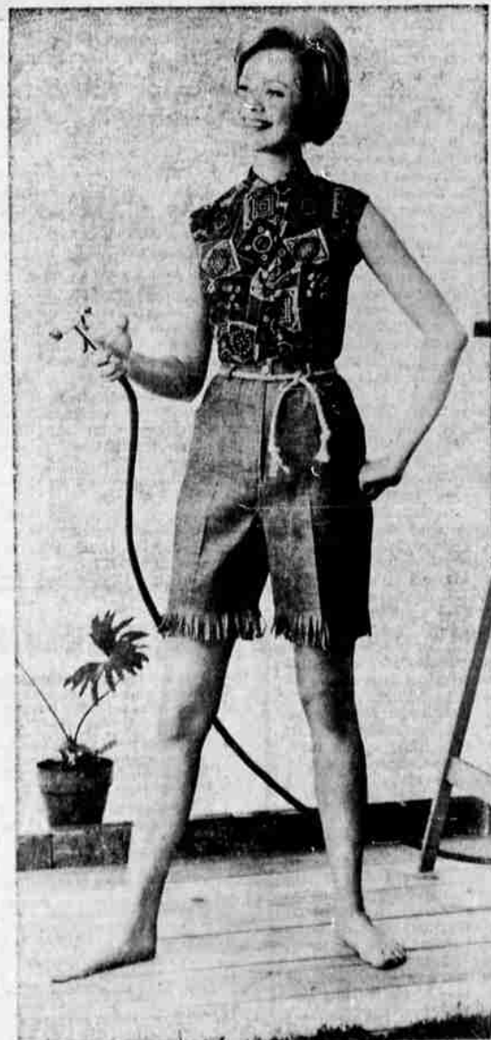
Bandanna prints and faded denim walkers fringed round the bottom have a "Country Look". These are from Bobbie Brooks' sportswear collection.