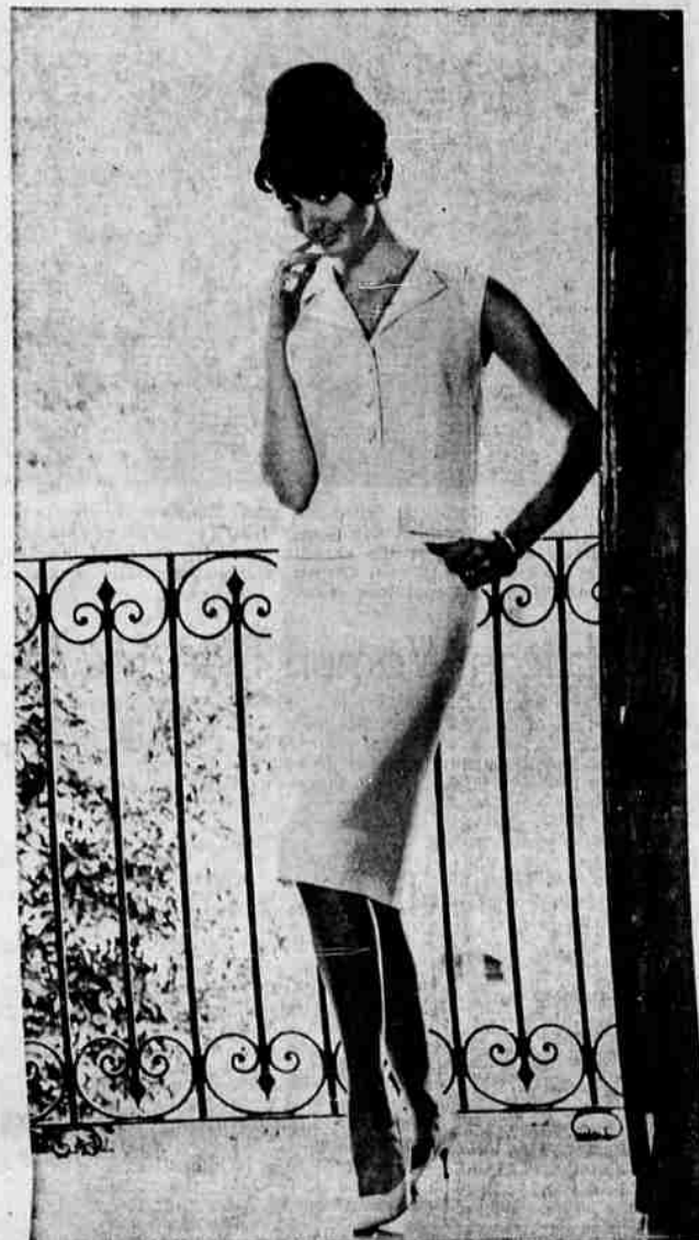
If summer wandering is in your scheme, this casual dress by Susan Thomas will be a blessing. Fashioned of Folker's washable linen-look fabric of Celanese Fortrel polyester and rayon, it will stay petal fresh in any warm climate.