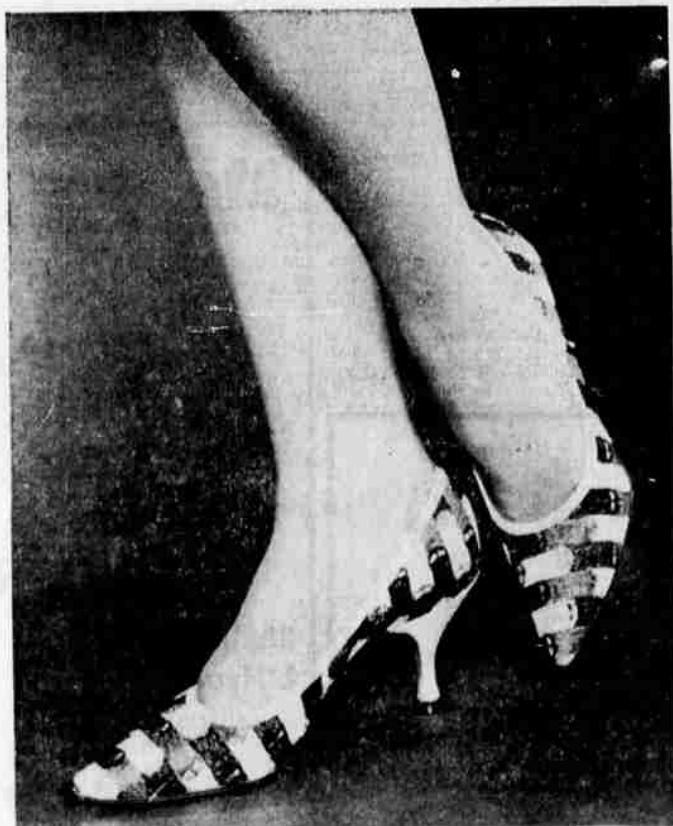
The perfect foil for the season's important pastel frocks is this De Lisa Deb pump made with a profusion of dainty eyelets for breeze-catching.