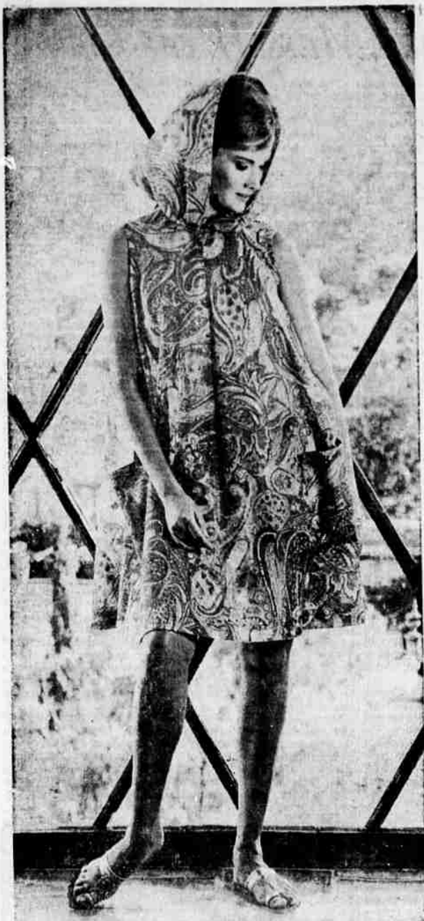
This feminine "swing shift" of Camay's Fortrel polyester voile and cotton is featherweight, looks deceptively delicate and will require little care. By Cabana, this shift is described as the best invention since the swim suit.