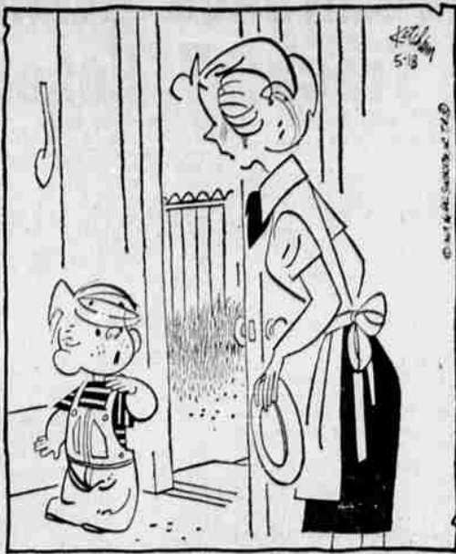
"MR. WILSON'S BEEN EATIN' TOO MUCH! HE SAID HE'S FED UP TO HERE!"