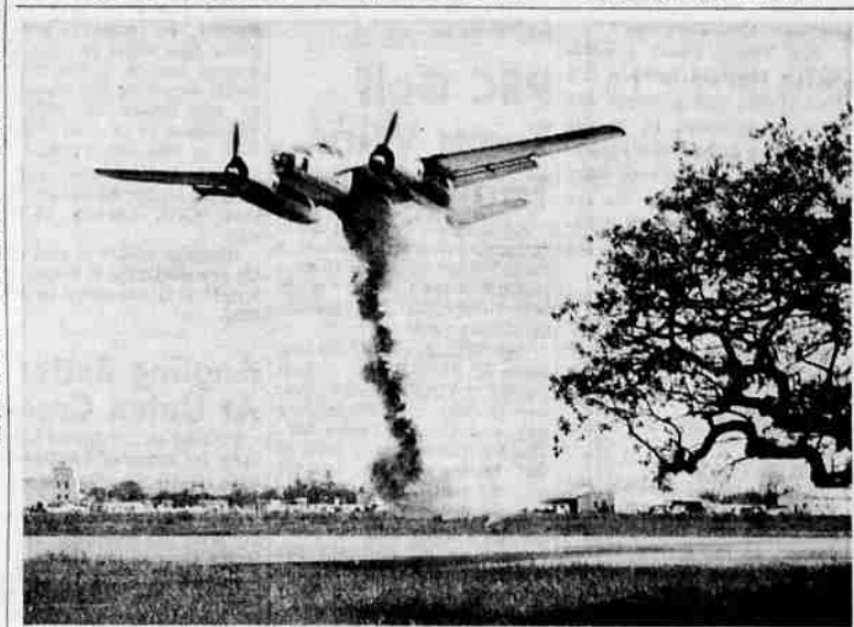
DEMONSTRATION - Forest fire fighting west district headquarters of the state department of forestry on Table Rock rd. was the site for most of the sessions. Personnel from area forest fire fighting agencies attended the event.

Recommended method of assessing the benefiting property will be on the basis of the county assessor's true market value.