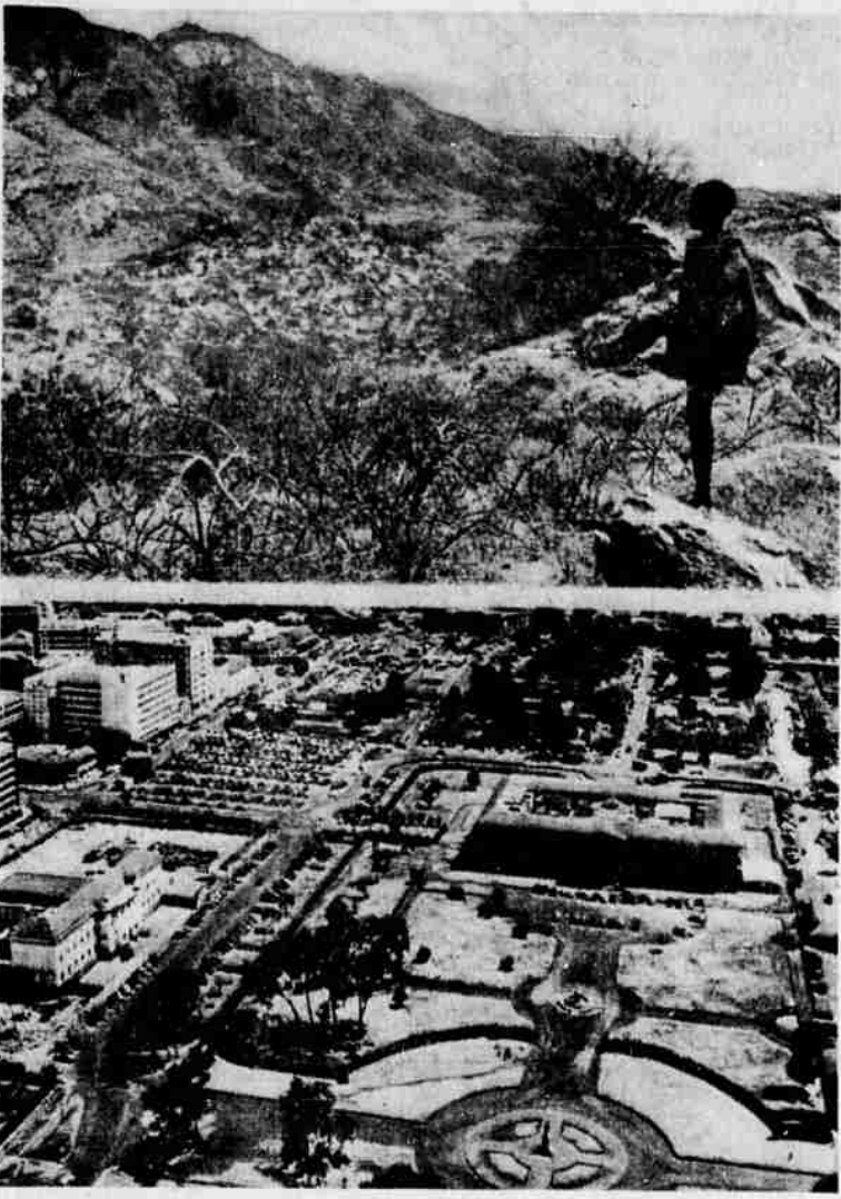
CONTRAST NOTED —Lone Turkana herdsman, at top, standing on rock looking toward Cherangani mountain range in Kenya's black semi-desert northern province, contrasts sharply with Nairobi's modern city square, shown in bottom picture. The first

step toward independence for Kenya, Great Britain's sole remaining possession on East African seaboard, will be taken during forthcoming Parliamentary elections.