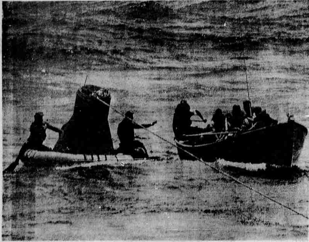
America's newest space man, L. Gordon Cooper, returned from space Thursday with the precision with which he was launched into orbit Wednesday. After 22.9 orbits and more than 34 hours in space, his capsule, Faith 7, splashed into the Pacific about five miles from the carrier, USS Kearsarge.