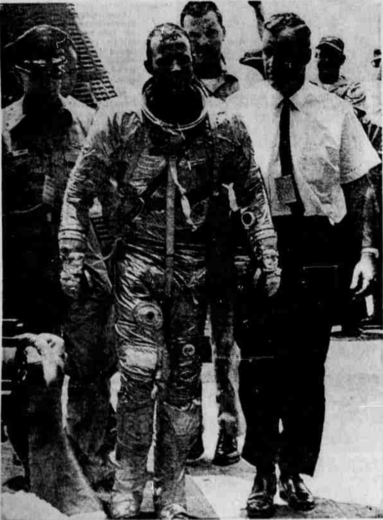
Astronaut L. Gordon Cooper, in picture at left above, waves to crewmen of the USS Kearsarge after he stepped out of the space capsule.