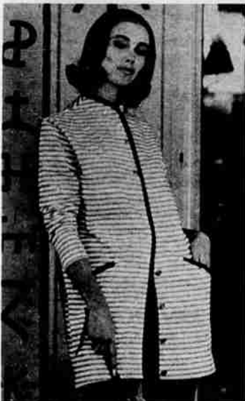
Borrowing the look of India's Nehru, Hartog "3" designs a slim cardigan shift in red and white stripes. About $15. Contrasting red pants, about $9.