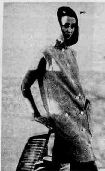
Wear a knee-length hooded shift for a quick spin to the shore or nearest patio. Swirling red checks are on a white ground. Jeanine Originals. $12.