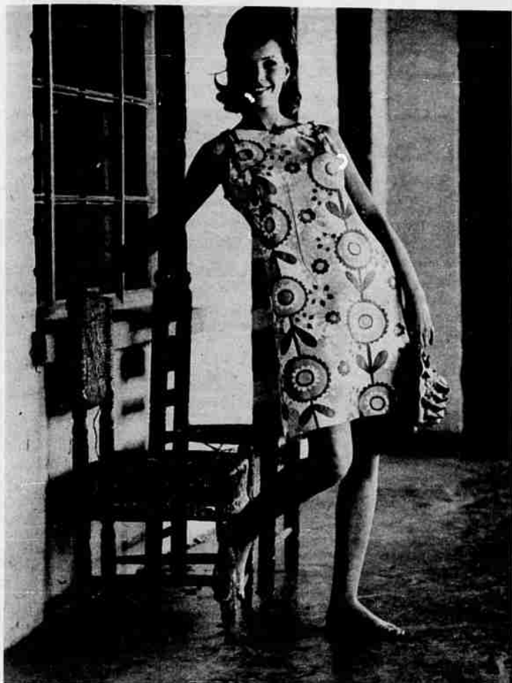
Sweda designs a slip of a shift in a hand-screened floral print that buttons at the shoulders. Swimsuit travelers will adore its instant cover-up. About $8.

Prediction: shifts will touch off a fashion landslide for summer '63.