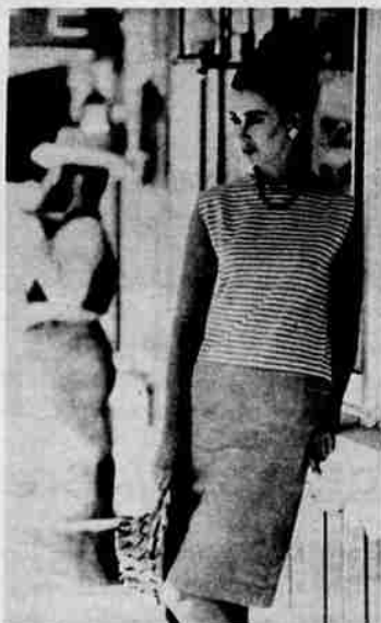
This one-piece figure skimmer, with a back zipper, travels to market with ease. Blue-and-white-striped top with blue skirt. By Knitmaster. About $12.