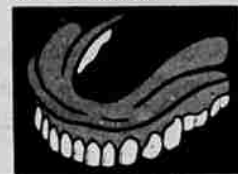
Accept no substitutes for Snug — the only testing soft plastic denture cushion.