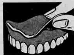
Complete set of two cushions for both uppers and lowers $1.50.