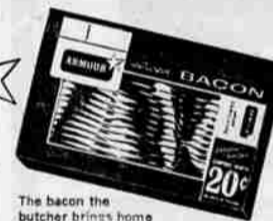
The bacon the butcher brings home