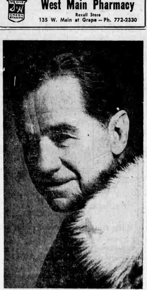
By kayak, yak back and jet

Lowell Thomas has traveled more than five million miles — by every known mode of transport — for the CBS Radio Network. He's a living legend, an author-reporter-explorer whose feats make modern history. Weekday evenings Lowell Thomas comes on with his unique reports of the day's news. This kind of alert, distinguished coverage fills our broadcast day. We tell what's happening here in town, across the nation, everywhere. We tell it first and best, paced by CBS Radio News on the hour and CBS Radio NetAlert around the clock.