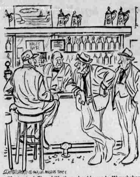
"Instead of Churchill, they should make Khrushchev a citizen. This way, if he starts a war with America, we can shoot him as an insurrectionist!"