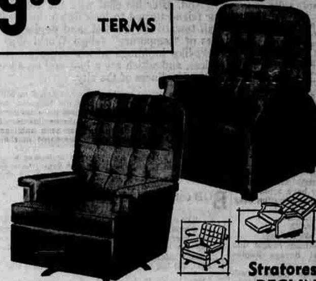
SWIVEL ROCKER $74 50