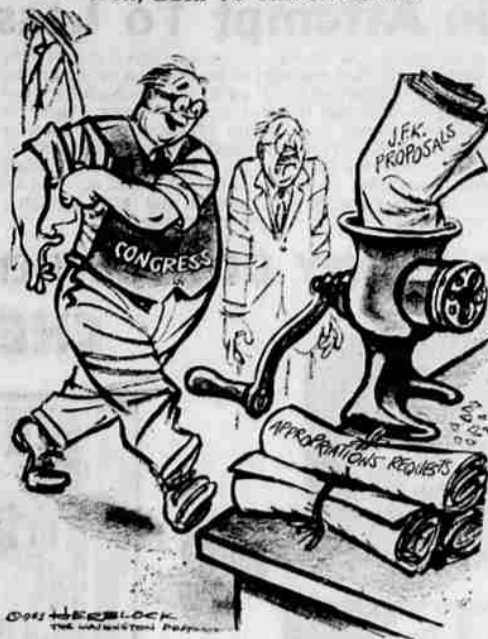
CON BY HERLOCK