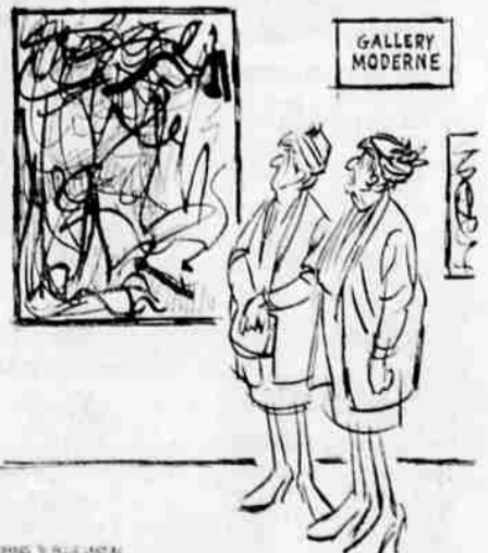
"It's like contemporary music — only this goes in one eye and out the other!"

When we say that someone has "independent means," we usually mean precisely the opposite — that he or she has inherited or