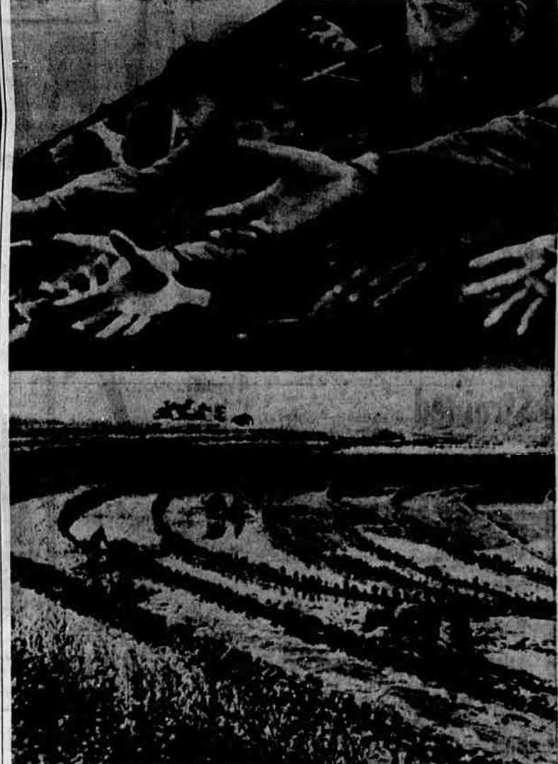
REACH FOR FOOD—Refugees being returned to Red China are shown here reaching for food. In the bottom photo, Szechuan Province farmers employ bullocks and crude wooden equipment to harrow paddy fields.