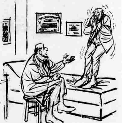
"Come, come, your fears are imagined. You don't know for sure that TV will be inundated with shows like 'The Beverly Hillbillies' next season!"

If an eminent college decides it is wasting its time in training nurses who will dispense paper clips, it is time for hospitals to take a hard and candid look at the way they handle patients, or mishandle them.