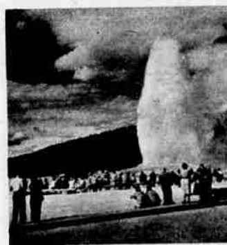
Yellowstone National Park

A couple of years ago earthquakes changed Old Faithful's timetable somewhat, but it still spouts faithfully. The spectacular coloring of the Grand Canyon of the Yellowstone makes it an outstanding feature of the park. The Wildlife Sanctuary is the largest and most successful in the nation.