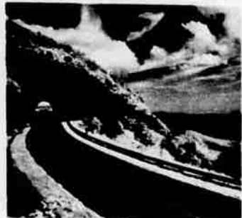
The Skyline Drive

It is a magnificent motoring experience to drive along the backbone of Virginia's Blue Ridge Mountains with your head literally in the clouds at times and the broad vistas of the Shenandoah Valley on one side and the Piedmont Plain on the other.