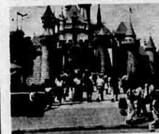
Los Angeles Area

Movieland, Disneyland, and television make this area popular. If you want to see a tv show, write several weeks in advance for tickets. Movie studios can be visited only if you have a personal contact or take part in a standard commercial tour. Disneyland, perhaps the most costly tourist attraction in America, is well worth a visit.