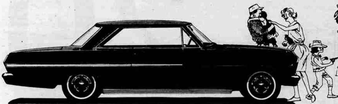
CHEVY II NOVA 400 SPORT COUPE