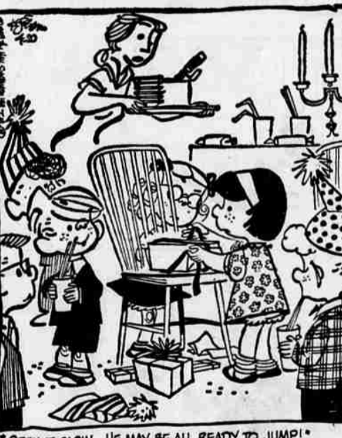
*OPEN IT SLOW. HE MAY BE ALL READY TO JUMP!*