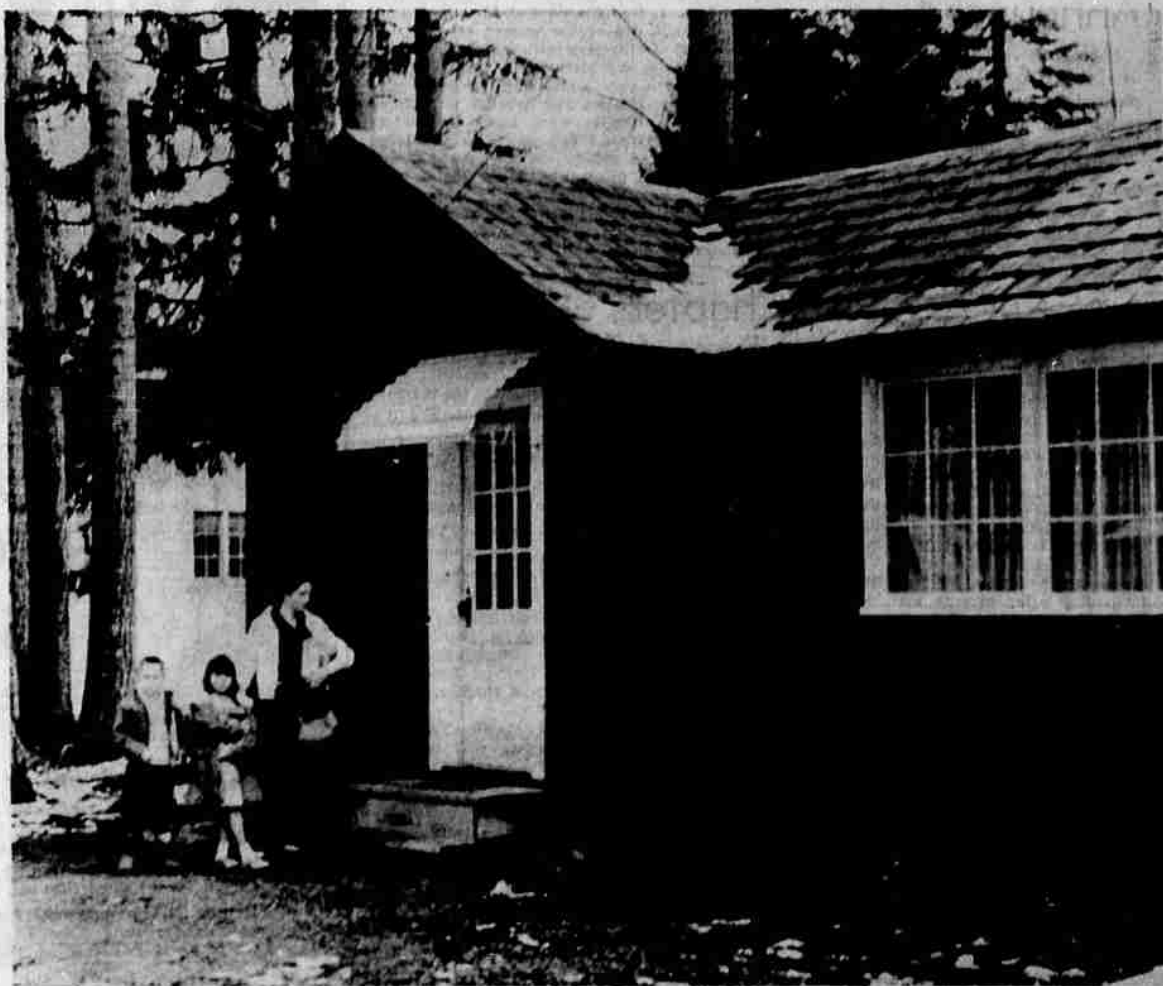
The Prospect branch library building was constructed by the residents of the community as a volunteer effort. The building was started about three years ago, and a wing added last year. In most instances, towns of the outlying areas in Jackson county supply quarters, and the main library provides the books and a branch librarian. Open house for the Prospect library will be held Tuesday, April 23, from 12 noon until 4 p.m.