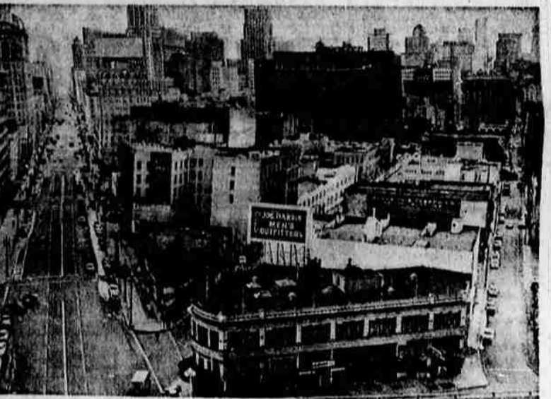
SAME DOWNTOWN AREA — Today the quake and fire, shows no remaining scars. Thursday was the 57th anniversary of the which was destroyed in the 1906 earth- disaster.