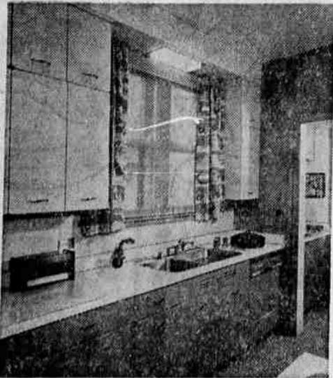
'AFTER' VIEW —After remodeling: Now kitchen has windows over sink, whisper-quiet steel cabinets, drawers and cupboards. The plastic laminate counter top is an ideal work surface while appliances have their proper place. The old butler's pantry has more cupboards and an extra sink. The color scheme is cheerful and bright, picking up its cues from the cabinets' textured Impasta finish.