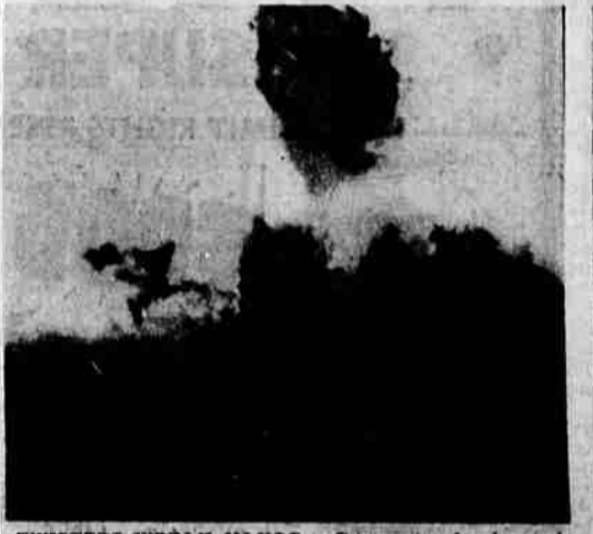
TWISTERS WREAK HAVOC —Occupants of a house in Exline, Ill., remove their possessions after a tornado struck the area late Wednesday, upper photo. The picture at lower left, taken from Kankakee, Ill., shows a tornado as it crossed Highway 54 north of Bradley, Ill. In the photo at