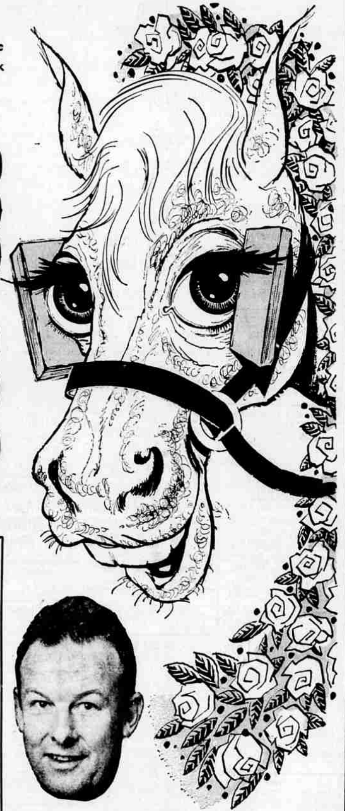
Bob Taylor (Head Trainer)

This is just another way to prove to you that we will go all out to help you buy the car of your choice at DEAN & TAYLOR'S. We have a large selection of good used cars and trucks, priced from $99 and up. If you're looking for a used car it will pay you to drive out to "WIDE-TRACK TOWN" and take advantage of our 3 day "TRADE FOR ANYTHING SALE."