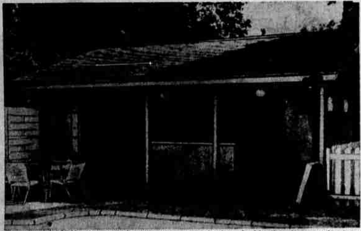
CABANA DESIGN —As more homeowners add pools to their property, interest grows in ideas to make pools even more enjoyable. This stimulated the design of the cabana shown here. Wood roof and marine plywood exterior construction help resist weathering. Inside there's a small storage closet, men's and women's dressing rooms, an across-the-front patio is open on two sides and has a bar and stools. The overall dimensions are 18'x22'; the patio is 9'x18'.

A family that is content with its neighborhood — has children in school and except for its space shortage, is satisfied with the house, is not likely to want to change dwellings. What, then, does this family do to find that needed extra space right at home? Look for Space It's obvious that you "make space" if it doesn't exist. Generally, any home can be expanded when skillfully remodeled. For instance, unused attics and basements can be converted into useful living space. Kitchens, bathrooms and other areas can be rearranged to be more efficient within existing space. Where the lot size and shape permit it, adding on a room may solve the space problem. One of the best ways to figure out what you can do is to look at what others have done in similar situations. Here are some examples of families who solved their space problems through remodeling. Attic Finished One family, with a post-war two-bedroom home, discovered that the attic helped solve their problem. Its 325 square feet was being used as a catchall for unwanted "junk" — the kind that most families collect.