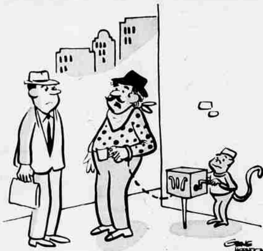
"He saved his money and bought me out."