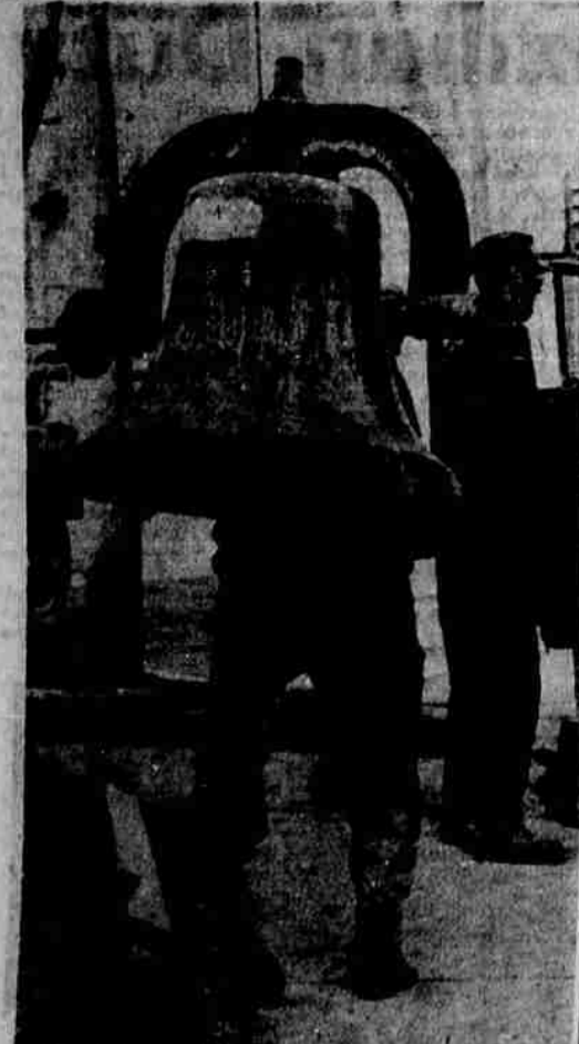
TRAPPED BY BELL —This is not a bell ringer who got too close to his work, nor is it a walking bell. The one-tone bronze bell was lowered from a steeple of the 86-year-old First Methodist church at Oconomowoc, Wis. and the worker went inside the bell to remove its clapper before loading it aboard a truck. The church was razed to make room for a new church, in which the old bell will be used.