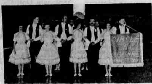
GRAND MARCH—Leading the grand march at the square dance jamboree at Yreka Sunday afternoon was the host club, the Circle-N-Square of Yreka.