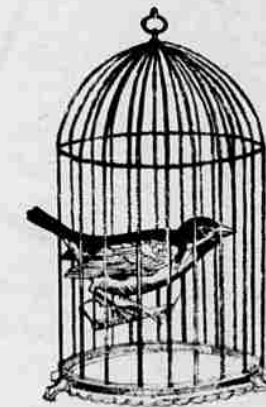
ILLUSTRATION BY JOHN WOOLHISER

But something in him seemed to beg for help. The noise in the store was