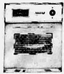
EDV-16A White porcelain control panel, automatic clock, timer, huge all porcelain oven, lift-off oven door, Visalife oven window, two non-sticking oven racks, lift-up rod-type oven element, removable oven door seals, porcelain broiler pan with insert.

Saturday, April 13th is the last day of the Cal/Ore Bonus Allowance of $20 on Ranges and $15 on a quick-recovery Water Heater. If you can't use a heater or range until later on, BEAVER will store it for you until you are ready to pick it up. Take advantage of BEAVER'S low prices and the Cal/Ore Bonus Allowance NOW!