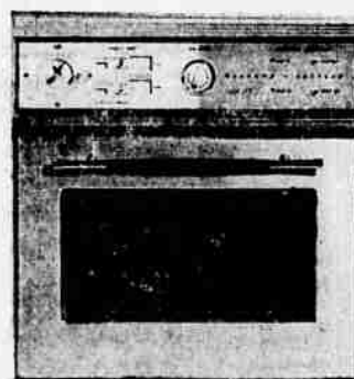
MODEL 20-36 OVEN