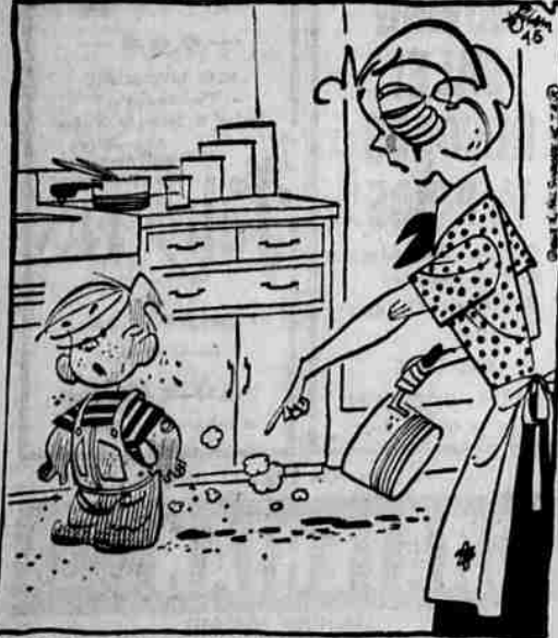
"I DID WIPE MY FEET! THAT'S FALLIN' OFF THE REST OF ME!"