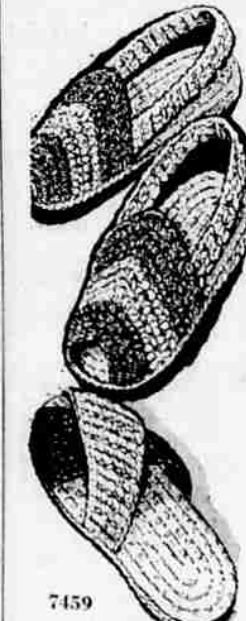
7459 by Alice Brooks.

Keep feet cool, comfortable in airy sandals or slippers. Easy to pack, washable! Sandals—all crocheted, even soles. Thrifty to make of rug cotton, rags in gay colors. Pattern 7459: directions, sizes small, med., large, included.