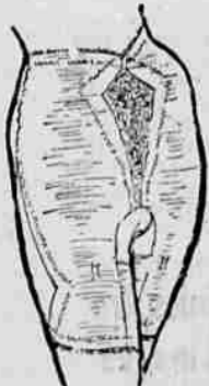
New "Diamond" Design Longleg Pantie Style 277 created in spandex powernet. Diamond shaped nylon lace front panel, satin elastic side panel and self-reinforced back panel for superb shaping. Waistline styling. White. S-M-L