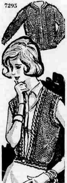
by Alice Brooks

Tops in fashion! Knit vest or cardigan in seed stitch with cable trim.