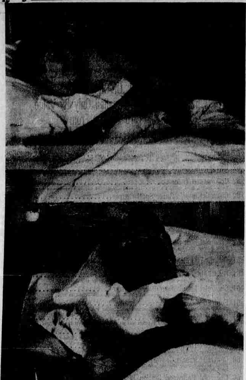
IN HOSPITAL - Helen Klaben, 21, upper photo, and Ralph Flores, 42, are shown in Whitehorse General Hospital at Whitehorse, Y.T., where they are recuperating after spending 48 days in the wild Yukon Territory when their light plane crashed on a flight from Fairbanks, Alaska, to the United States. Despite multiple injuries, they survived mainly on a diet of toothpaste and melted snow.