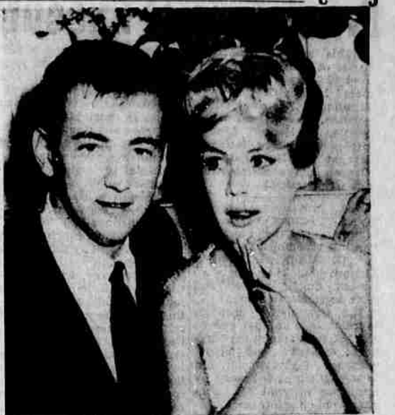
COUPLE SEPARATES - Singer Bobby Darin and actress Sandra Dee, one of Hollywood's youngest and most publicized couples, have separated. Rumors have been circulating that the couple, both with highly successful careers, were on the verge of splitting up. Darin, 26, and Miss Dee, 20, were married Dec. 1, 1960, and have one child.

When the astronauts reach the end of that walkway, they will step aboard the most powerful piece of space machinery ever built. It will be filled with liquid oxygen and hydrogen, high-grade kerosene and nitrogen tetroxide - all explosive. Short Time Away The Saturn-5 will leave the ground with about 5.4 million pounds of fuel aboard - enough to blow a good-sized hole in Cape Canaveral or anywhere else. The unsung part of America's program to put men on the moon is the part that will stay right here on the ground. The engineering that must go into it puts the Egyptian pyramids, Hoover dam, and ear-