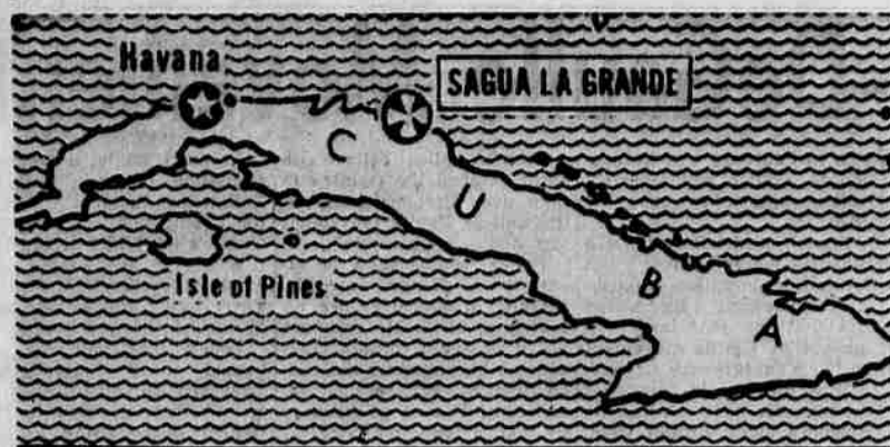
ATTACKED BY RAIDERS - A Russian freighter in Sagua la Grande, a northern Cuban coast port, was attacked by Cuban exile sea raiders firing cannon early Monday while another raiding party shelled a Russian military camp nearby, authoritative refugee sources said in Miami. The twin attacks caused "considerable damage" and apparently left a number of Russian dead and wounded, according to the informants. (UPI)