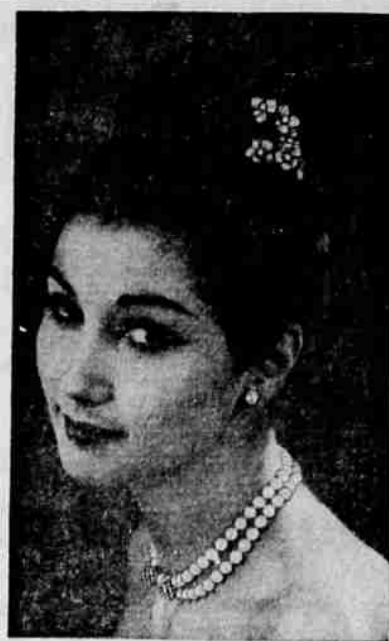
FLOWER CLIPS —Pointing up a pretty coiffure are petal flower clips, placed to form a tiny bouquet. Center of each gold-filled flower is a cultured pearl. Necklace shape can be varied with adjustable clasps. By Imperial Pearl.

It should be an exciting and fashionable swimsuit season due to the news in color, fabric and silhouette. Every woman will be tempted to buy more than one swimsuit to have these important fashion looks in swimwear.