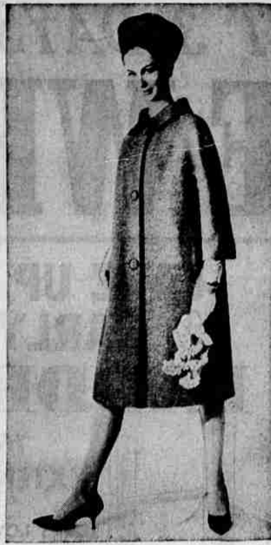
SHARE HONORS —Light and airy shares honors with crisp and classic in the spring texture news, as these coats illustrate. At left is a softly feminine coat, with back fullness, in textured British mohair. Coat at