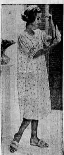
BATISTE —Violets bloom all over a batiste peignoir, smocked with nylon lace. By Barbizon. And to pamper complexions, an after-bath Sardolette.

JUMPERS FOR SPRING New jumper looks for spring feature the wrap style and the ya-ya, with low hip slash.