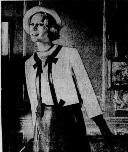
LEATHER SUIT —Fashion predicts fair leather ahead. Smooth leather spring suit has Chanel-type jacket, in white with taupe, and taupe A-line, lightly gored skirt. Brimmed leather hat complements the costume, completes just one of many leather fashion ideas of the season. Suit from Highlander; hat by Jack McConnell; photo by Leather Industries of America.

COLORFUL HOUSEWARES White is still the leading color preference of homemakers when they choose housewares, but blue is coming up strong, according to a recent nationwide survey. Yellow, turquoise, pink, beige, green and brown are other popular choices.