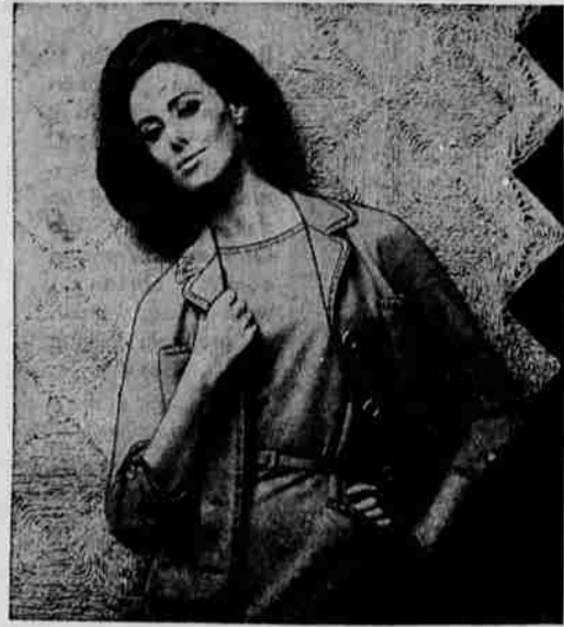
KNIT WOOL—Spring ensemble pairs a femininely-fitted wool knit dress and matching jacket, shaped like a shirt with notched collar and revers, buttoned cuffs and high pockets. Trend to open-air casualness is reflected in costume's contrast saddle stitching. By Tricosa-Feder of Paris.

(with and without foam backing). NEW cropped slickers are leveling off two and four inches below the hipline. The costume, in rainwear is growing slowly but steadily. Devotees of the rainsuit, the raincoat and dress, the poncho and skirt continue to present them with fashion conviction. There will always be the classics with, balmacans now flipping from solid poplin to leopard print or in poplin lined with poplin. Trenchcoats now look better with single breasted closings. Chesterfields now come in madras type plaids; many of these are for all seasons with Millium linings. Texture is shown in the real and simulated linens and the real or simulated wild silks. Prints are big... wild... colorful... often zany; they come in abstracts, giant paisleys and photographic florals.