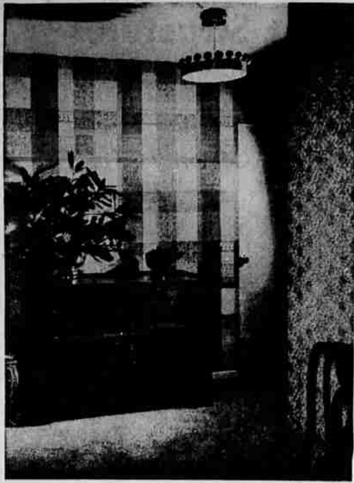
PLAID WALLPAPER —Bold plaid wallpaper makes a handsome background for a large chest, which holds hi-fi equipment. For continuity in decorating, the plaid is used in the foyer, and on an adjacent living room wall is a companion paper which reproduces a floral motif from the plaid as an over-all pattern. Papers are "Country Plaid" and "Country Rose" by C. W. Stockwell.