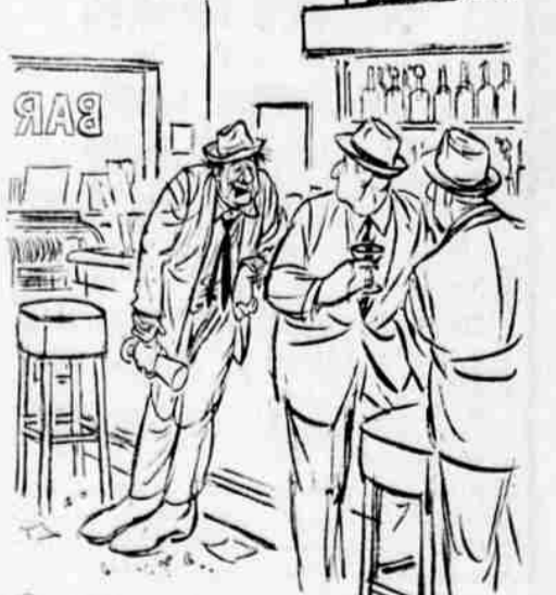
"Listen to this—The first condition of immortality is death.—How true, how true!"