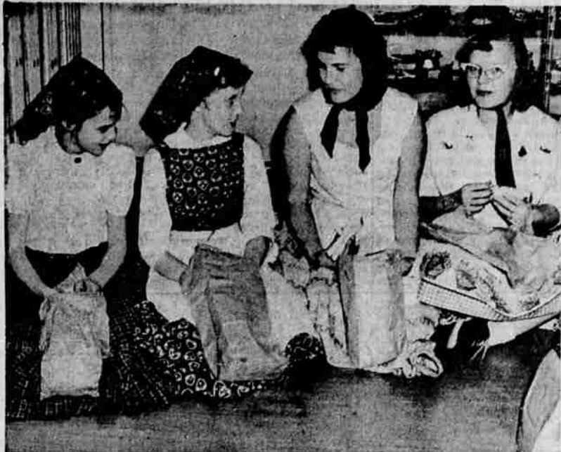
The more than 2,000 Girl Scouts in the Rogue Valley Girl Scout council will carry on special activities beginning today in observance of the annual Girl Scout week. The annual go-to-church projects, the annual cookie sale and other events will be carried on throughout the week. A recent