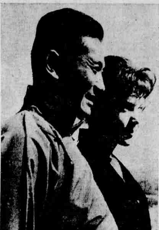
New Delhi—Maharajkumar (Crown Prince) of Sikkim, and his fiancée, Hope Cooke, a former Sarah Lawrence college student, are shown here in a photograph made in 1962. The couple will be married in Gangtok, capital of Sikkim, on March 20.