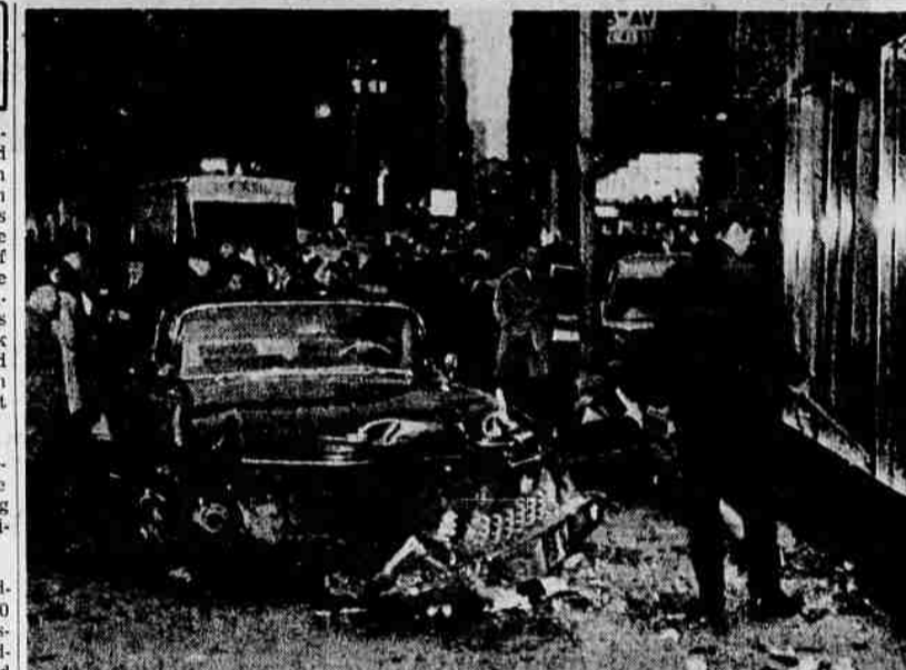
LOOK AT DAMAGE - Pedestrians look at knocking down a traffic signal and smashing the damage after a car went out of control a fire hydrant. The driver and two women in New York Tuesday, mounting the curb, on the sidewalk were injured.