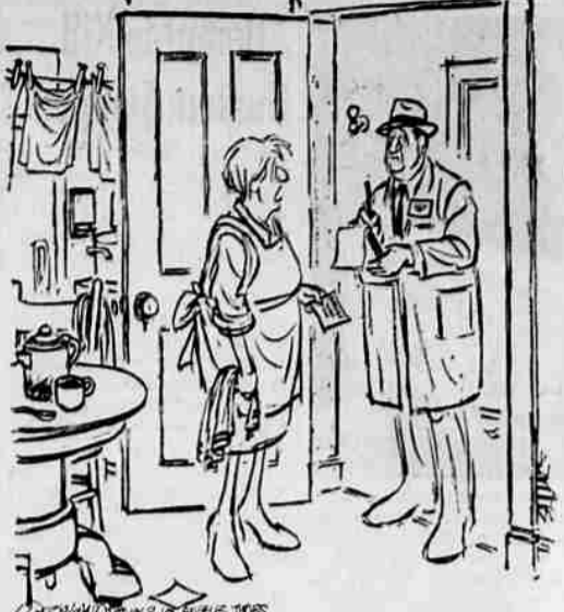
"My opinion on world affairs? As Will Rogers might have said, all I know is what I hear on TV panel discussion show!"