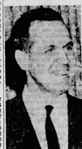
COACH-OF-YEAR - Ed Jucker of the Cincinnati Bearcats (shown in 1961 photo) today was voted basketball coach-of-the-year by United Press International.

Green, 11; 18. St. Joseph's Pa., 7; 19. Seattle, 6; 20. West Virginia, 4.